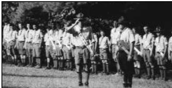
Horseshoe salutes HSRAA Alumni/ae.

"To preserve and promote the spirit and heritage of Horseshoe Scout Reservation and its camps (Camp Horseshoe and Camp John H. Ware, III), to be a benefactor to the Reservation and to promote the brotherhood of Scouting among the alumni of the Reservation."