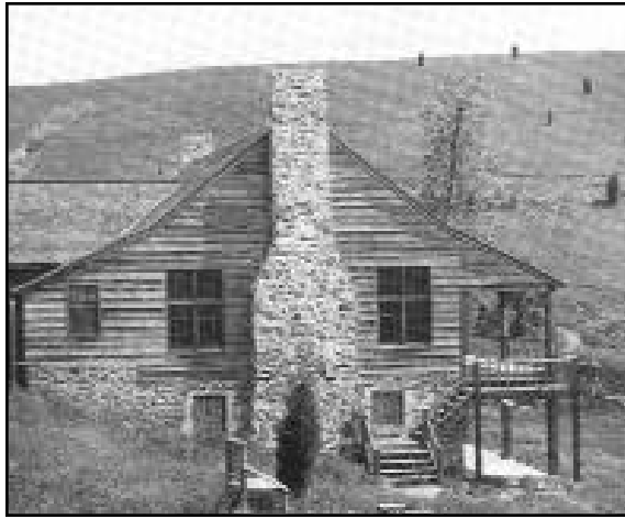
Goat Hill, re-named Flag Pole Hill as seen in 1928 from Kindness Center.

Goat Hill — the ridge of land that lies between Camp Horseshoe and Camp John H. Ware, III